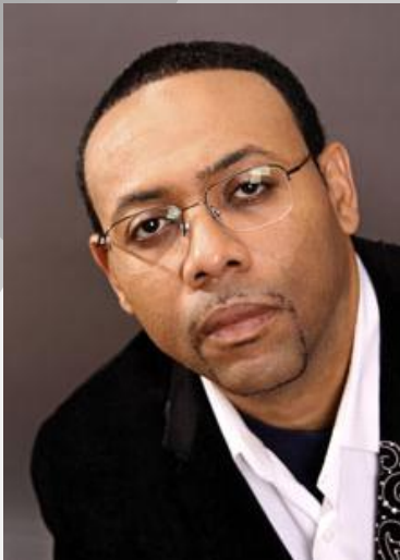
THE WARREN BALLENTINE SHOW with Warren Ballentine