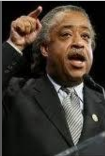
THE AL SHARPTON SHOW with Al Sharpton

1639 Gentilly Blvd. New Orleans, LA 70119 (504)-942-0106